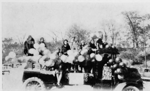
Tri Delt entry—"Kansas City Kitty"

The crowded alumni and student sections of the stadium applauded the announcement that Alpha Chi Omega Sorority for the third successive year won first place in the women's division of the parade. Their entry represented a large ship containing comely pirates who were supposed to make the Denison jinx walk the plank.