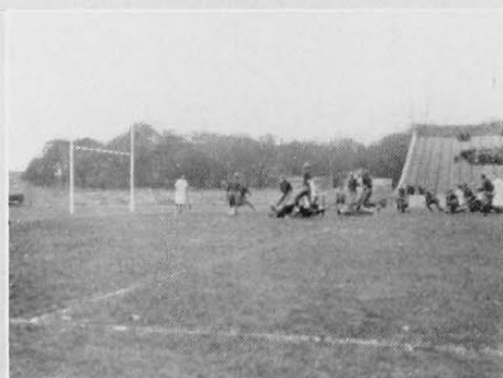
One of the many