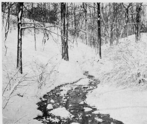
Burnet Woods in winter

Old Man Winter enters with December, bringing along the first snow fall of the year, and transforming Burnet Woods to a place of swirling drifts and winds that howl across the lake. On the breast of summer, sleeping autumn lies, and paths in the woods lately trod by strolling couples, now assume an atmosphere of frozen beauty and frozen emotion.