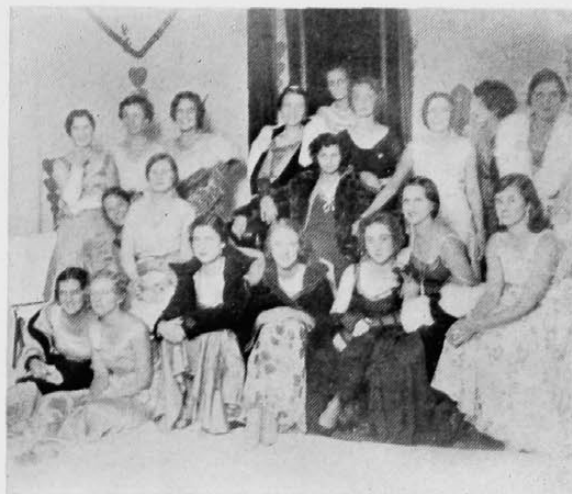
Kappa Christmas Formal

Please don't get the idea from the picture of the Kappa Christmas dance that the Kappa don't have any males around. On the contrary did you ever see a Kappa anywhere without several males around?