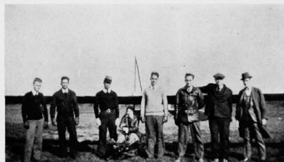
U. C. glider enthusiasts at Lunken Airport