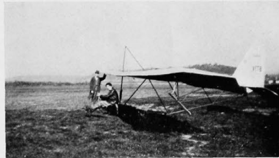
The club's pride and joy

Interest in Aeronautics is steadily increasing and with the Aero Club as a nucleus we feel that it will soon become a major activity on the campus.