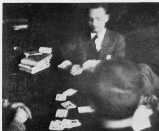
Bumming Room Card Sharps