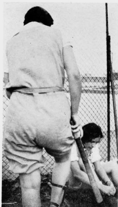
She liked big, strong, silent men