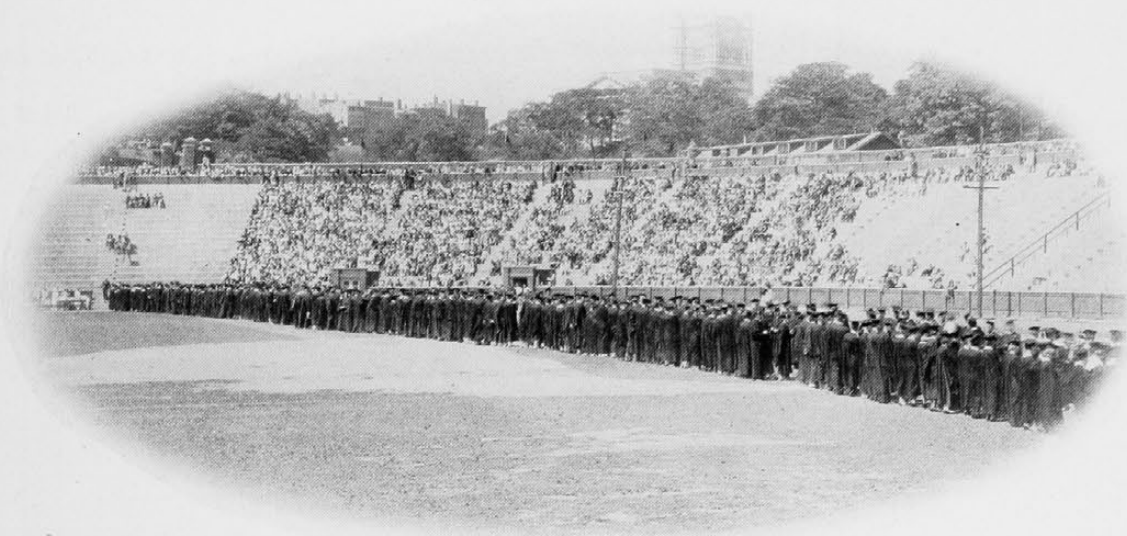
To brothers and friends and classmates

For the senior is graduating to law-courts and teaching positions, to hospitals and telephone offices, to road gangs and insurance companies, to newspaper offices, laboratories, stock-companies, drug-stores and weddings, to write and to paint and to loaf, to travel and earn money, to travel and spend money, to advertising jobs and department stores, to ball clubs, Broadway footlights, Indiana farms. The senior is taking his place in life. Farewell! Farewell!