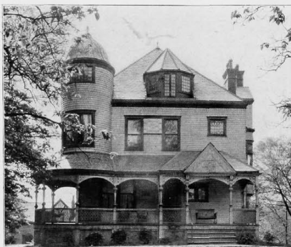
3465 Cornell Place

Founded, 1917 Denison University 11 Chapters