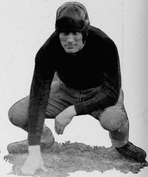
Ruck — Tackle