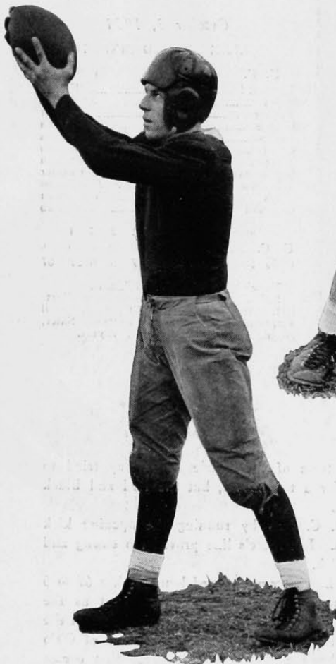
Hiel — End