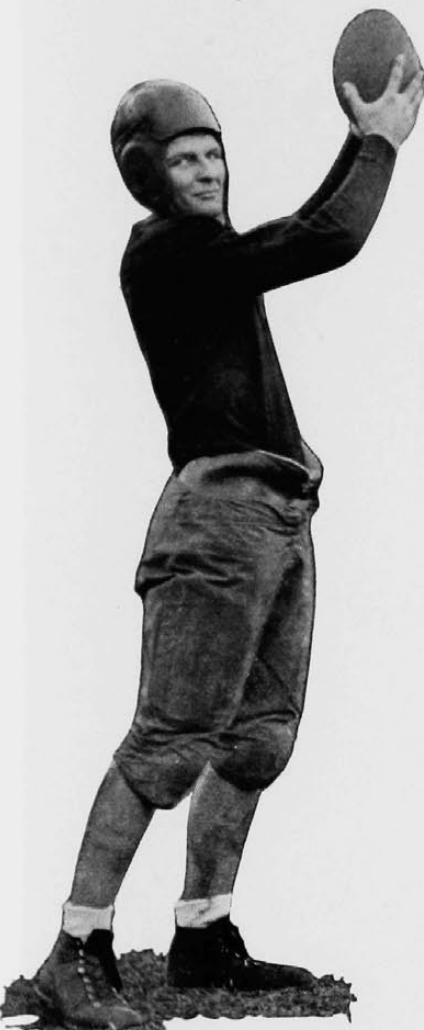
Metz — End