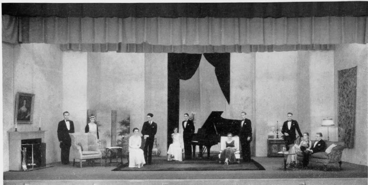
A Scene from "Holiday"