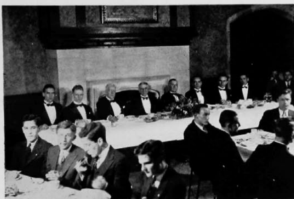
Varsity Pledge Dinner

The Freshman Work Committee of the "Y" plans a program each year to bridge the gap between high school and college, to acquaint the new students with the many phases of college life, to give social gatherings for them, and to train leaders for the coming years in college. The Freshman convocation and dance in the Men's Gym was followed by a Student-Faculty Smoker and Open House at the "Y." The Varsity Pledge dinner and the Freshman Council itself were the two biggest projects of this year.