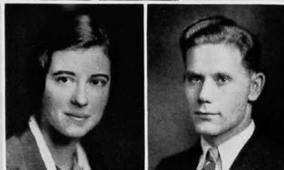
MARGARET SANGER R.N. KKΓ