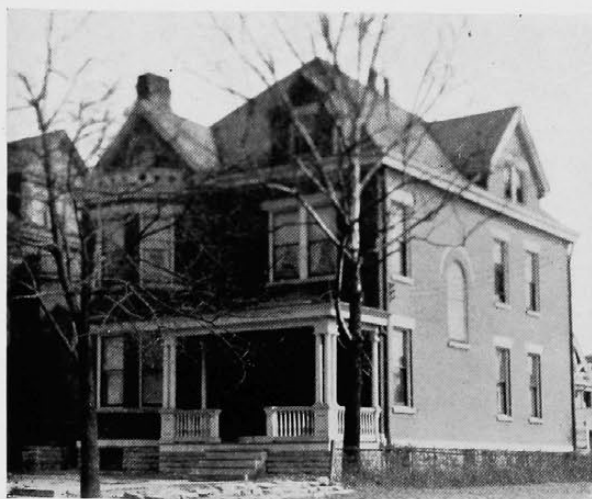
541 Howell Avenue