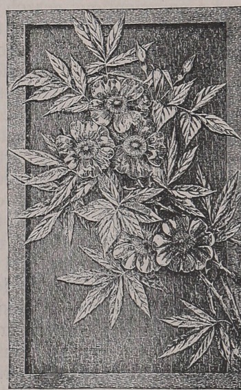
CARVED PANEL—SWAMP ROSE.

BY STUDENTS OF THE CINCINNATI ART SCHOOL.