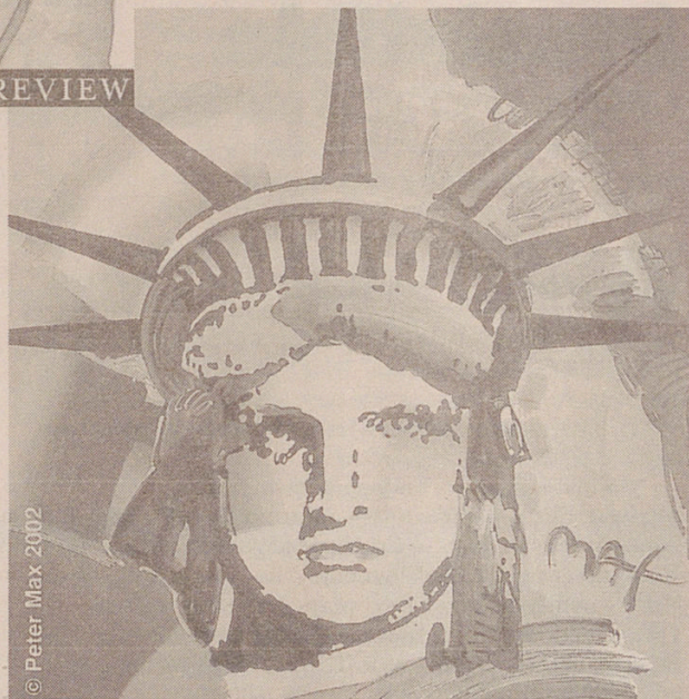
Artist Peter Max, now the owner of Cincinnati's runaway cow, raised funds for the SPCA with this image.

surely became "the" hip spot for the more adventurous, as the old warehouse in Brighton hosted interesting events almost every weekend. ... Speaking of Main Street, the 2001 riots left the blossoming art scene of Over-the-Rhine in turmoil. As this year comes to its close, more and more people are returning to the city, but the great burst of excitement around the art scene we felt in the late '90s has been subdued. Some galleries are rumored to be closing or moving out of the area. By the end of 2002, the rally cry to save the art scene in Over-the-Rhine is greater than ever. ... Through all these great transitions, one thing remains certain: Cincinnati will never lose its great tradition of presenting good art in historically relevant or architecturally significant venues and neighborhoods. Now more than ever, it's vital to support our art community through this period of change. Make a New Year's resolution to see more art in 2003. With all the exciting things coming down the pike, that shouldn't be too difficult.